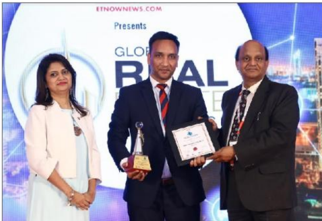
Alpha International City Awarded as 'Integrated Township of the Year'

A visionary development in Karnal, Alpha International city (AICK), an integrated plotted township by Alpha Corp was awarded as 'The Integrated Township of the Year' at the premium level 'Real Estate Awards 2019'. The company received the award for delivering the best services to its end users. The event was presented by ET Now on Friday at Taj Lands End, Mumbai.