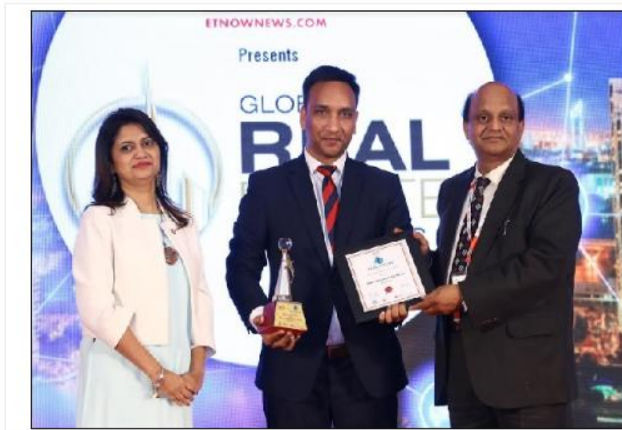
Alpha International City Awarded as 'Integrated Township of the Year'

A visionary development in Karnal, Alpha International city (AICK), an integrated plotted township by Alpha Corp was awarded as 'The Integrated Township of the Year' at the premium level 'Real Estate Awards 2019'. The company received the award for delivering the best services to its end users. The event was presented by ET Now on Friday at Taj Lands End, Mumbai.