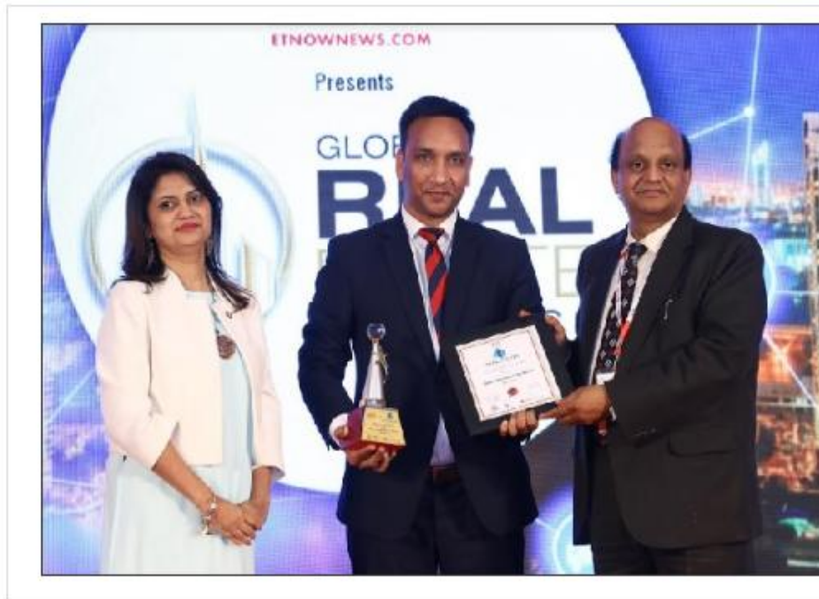
Alpha International City Awarded as 'Integrated Township of the Year'

A visionary development in Karnal, Alpha International city (AICK), an integrated plotted township by Alpha Corp was awarded as 'The Integrated Township of the Year' at the premium level 'Real Estate Awards 2019'. The company received the award for delivering the best services to its end users. The event was presented by ET Now on Friday at Taj Lands End, Mumbai.