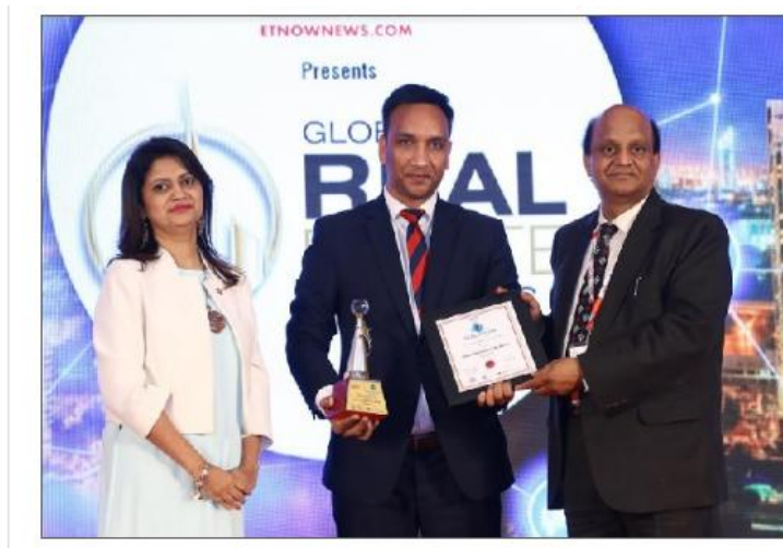
Alpha International City Awarded as 'Integrated Township of the Year'

A visionary development in Karnal, Alpha International city (AICK), an integrated plotted township by Alpha Corp was awarded as 'The Integrated Township of the Year' at the premium level 'Real Estate Awards 2019'. The company received the award for delivering the best services to its end users. The event was presented by ET Now on Friday at Taj Lands End, Mumbai.