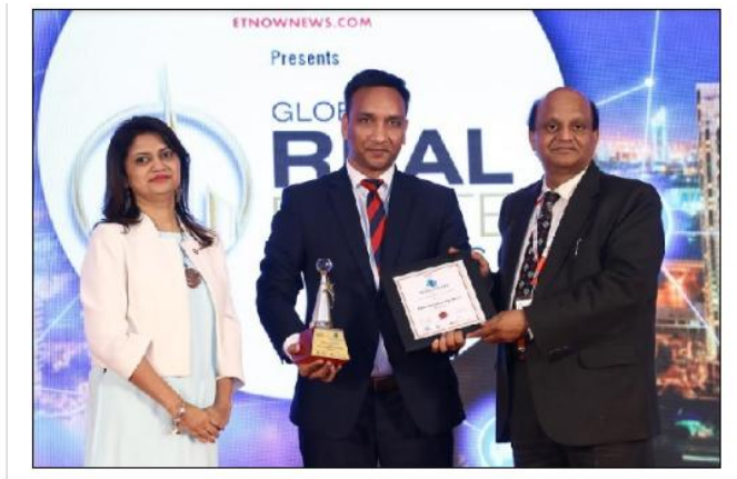
Alpha International City Awarded as 'Integrated Township of the Year'

A visionary development in Karnal, Alpha International city (AICK), an integrated plotted township by Alpha Corp was awarded as 'The Integrated Township of the Year' at the premium level 'Real Estate Awards 2019'. The company received the award for delivering the best services to its end users. The event was presented by ET Now on Friday at Taj Lands End, Mumbai.