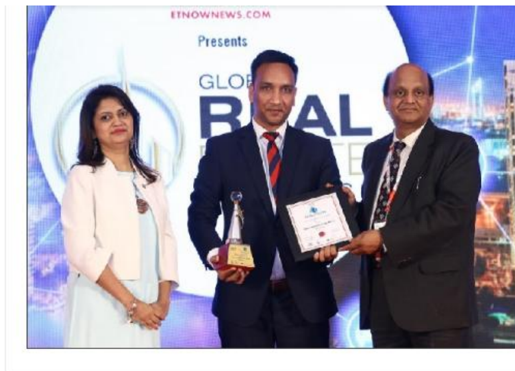
Alpha International City Awarded as 'Integrated Township of the Year'

A visionary development in Karnal, Alpha International city (AICK), an integrated plotted township by Alpha Corp was awarded as 'The Integrated Township of the Year' at the premium level 'Real Estate Awards 2019' . The company received the award for delivering the best services to its end users. The event was presented by ET Now on Friday at Taj Lands End, Mumbai.