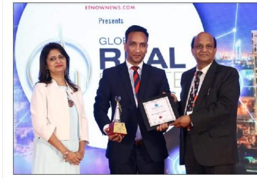
Alpha International City Awarded as 'Integrated Township of the Year'

A visionary development in Karnal, Alpha International city (AICK), an integrated plotted township by Alpha Corp was awarded as 'The Integrated Township of the Year' at the premium level 'Real Estate Awards 2019'. The company received the award for delivering the best services to its end users. The event was presented by ET Now on Friday at Taj Lands End, Mumbai.