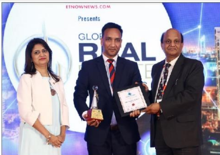
Alpha International City Awarded as 'Integrated Township of the Year'

A visionary development in Karnal, Alpha International city (AICK), an integrated plotted township by Alpha Corp was awarded as 'The Integrated Township of the Year ' at the premium level 'Real Estate Awards 2019'. The company received the award for delivering the best services to its end users. The event was presented by ET Now on Friday at Taj Lands End, Mumbai.