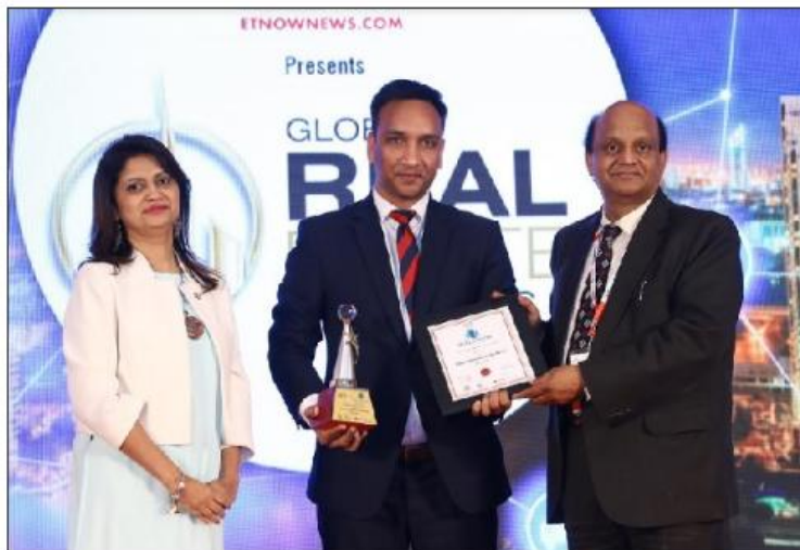
Alpha International City Awarded as 'Integrated Township of the Year'

A visionary development in Karnal, Alpha International city (AICK), an integrated plotted township by Alpha Corp was awarded as 'The Integrated Township of the Year' at the premium level 'Real Estate Awards 2019'. The company received the award for delivering the best services to its end users. The event was presented by ET Now on Friday at Taj Lands End, Mumbai.