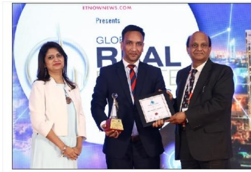
Alpha International City Awarded as 'Integrated Township of the Year'

A visionary development in Karnal, Alpha International city (AICK), an integrated plotted township by Alpha Corp was awarded as 'The Integrated Township of the Year' at the premium level 'Real Estate Awards 2019'. The company received the award for delivering the best services to its end users. The event was presented by ET Now on Friday at Taj Lands End, Mumbai.