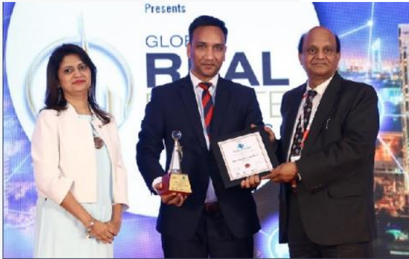
Alpha International City Awarded as 'Integrated Township of the Year'

A visionary development in Karnal, Alpha International city (AICK), an integrated plotted township by Alpha Corp was awarded as 'The Integrated Township of the Year' at the premium level 'Real Estate Awards 2019'. The company received the award for delivering the best services to its end users. The event was presented by ET Now on Friday at Taj Lands End, Mumbai.