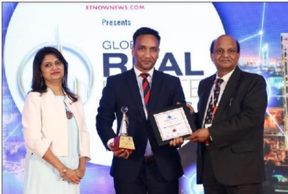
Alpha International City Awarded as 'Integrated Township of the Year'

A visionary development in Karnal, Alpha International city (AICK), an integrated plotted township by Alpha Corp was awarded as 'The Integrated Township of the Year' at the premium level 'Real Estate Awards 2019'. The company received the award for delivering the best services to its end users. The event was presented by ET Now on Friday at Taj Lands End, Mumbai.