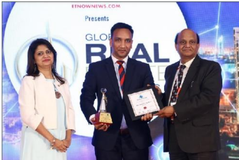
Alpha International City Awarded as 'Integrated Township of the Year'

A visionary development in Karnal, Alpha International city (AICK), an integrated plotted township by Alpha Corp was awarded as 'The Integrated Township of the Year' at the premium level 'Real Estate Awards 2019'. The company received the award for delivering the best services to its end users. The event was presented by ET Now on Friday at Taj Lands End, Mumbai.