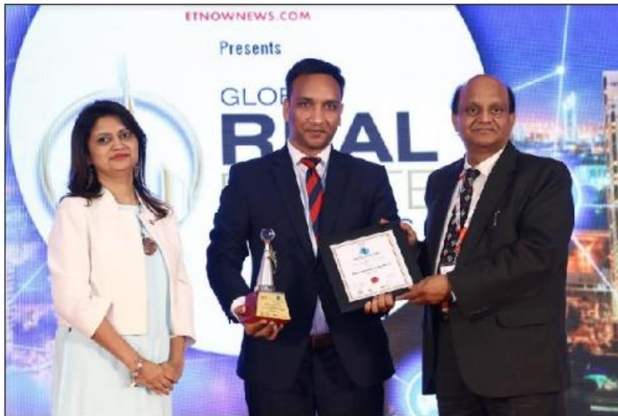
Alpha International City Awarded as 'Integrated Township of the Year'

A visionary development in Karnal, Alpha International city (AICK), an integrated plotted township by Alpha Corp was awarded as 'The Integrated Township of the Year' at the premium level 'Real Estate Awards 2019'. The company received the award for delivering the best services to its end users. The event was presented by ET Now on Friday at Taj Lands End, Mumbai.