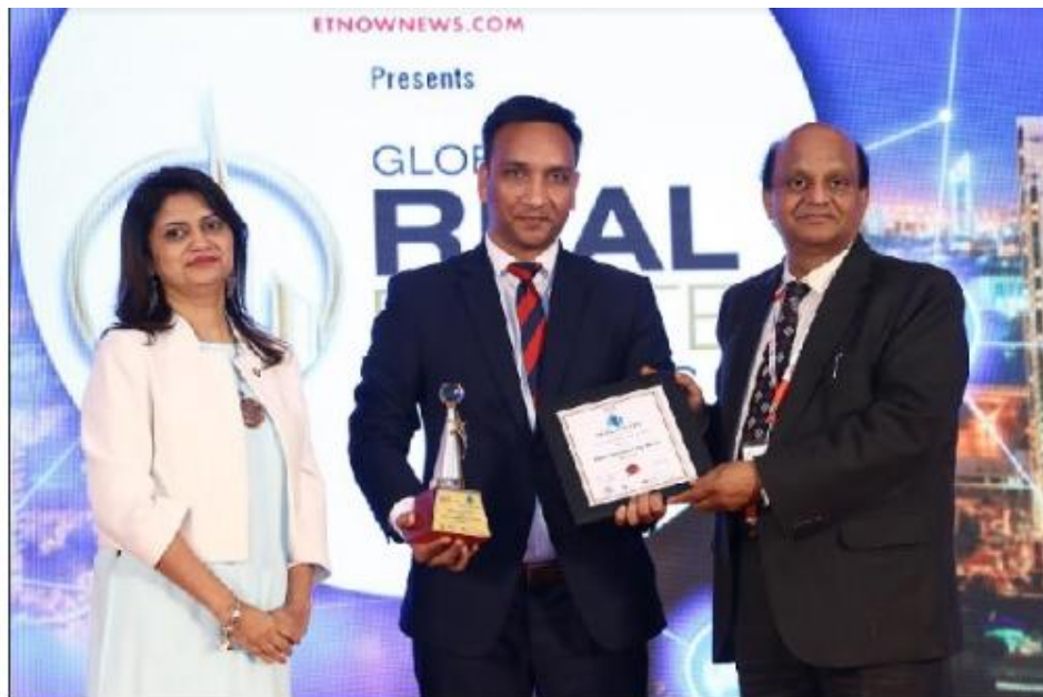
Alpha International City Awarded as 'Integrated Township of the Year'

A visionary development in Karnal, Alpha International city (AICK), an integrated plotted township by Alpha Corp was awarded as 'The Integrated Township of the Year' at the premium level 'Real Estate Awards 2019'. The company received the award for delivering the best services to its end users. The event was presented by ET Now on Friday at Taj Lands End, Mumbai.