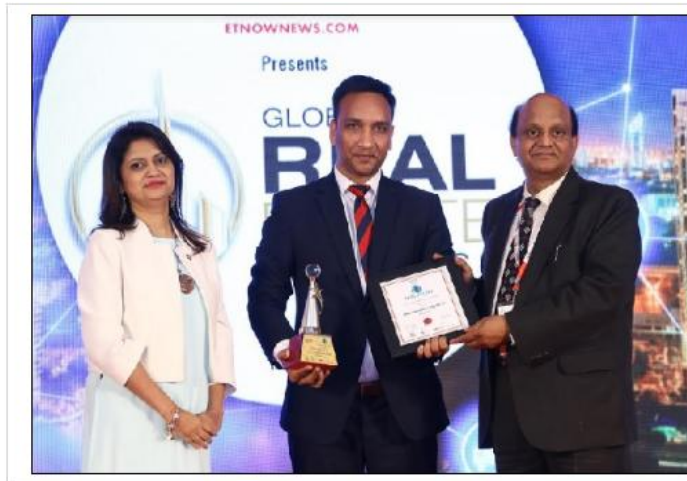
Alpha International City Awarded as 'Integrated Township of the Year'

A visionary development in Karnal, Alpha International city (AICK), an integrated plotted township by Alpha Corp was awarded as 'The Integrated Township of the Year' at the premium level 'Real Estate Awards 2019'. The company received the award for delivering the best services to its end users. The event was presented by ET Now on Friday at Taj Lands End, Mumbai.