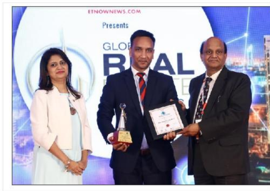
Alpha International City Awarded as 'Integrated Township of the Year'

A visionary development in Karnal, Alpha International city (AICK), an integrated plotted township by Alpha Corp was awarded as 'The Integrated Township of the Year' at the premium level 'Real Estate Awards 2019'. The company received the award for delivering the best services to its end users. The event was presented by ET Now on Friday at Taj Lands End, Mumbai.