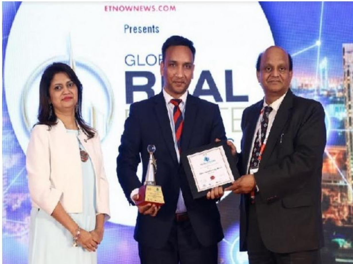
Alpha International City Awarded as 'Integrated Township of the Year'

https://www.aninews.in/news/business/business/alpha-international-city-awarded-as-integrated-township-of-the-year20190225164154/