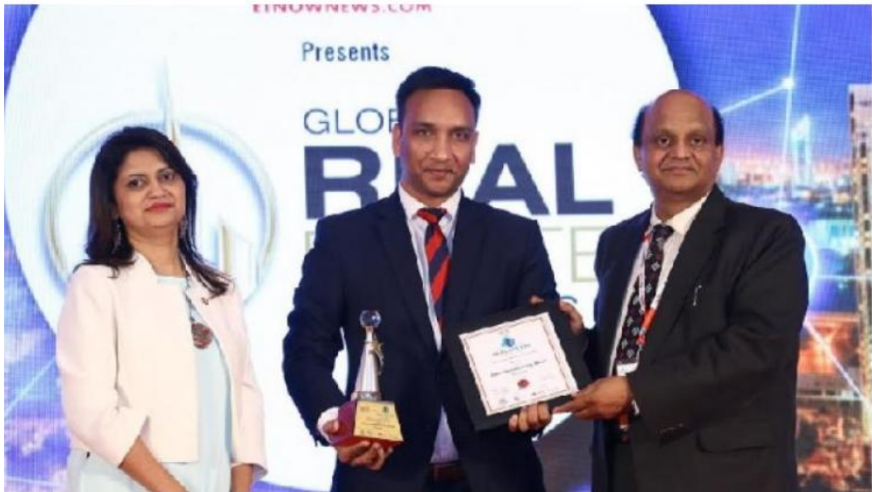
Alpha International City Awarded as 'Integrated Township of the Year'.

The township is designed to cater to the multifaceted needs of its residents.