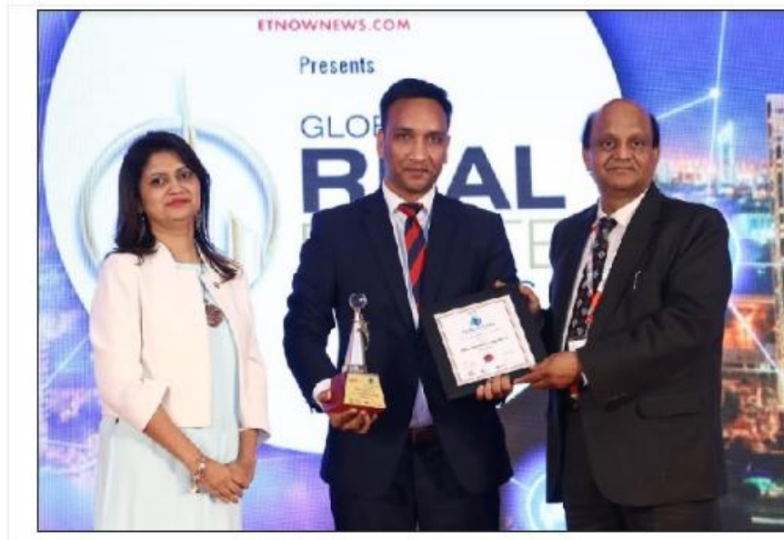
Alpha International City Awarded as 'Integrated Township of the Year'

A visionary development in Karnal, Alpha International city (AICK), an integrated plotted township by Alpha Corp was awarded as 'The Integrated Township of the Year' at the premium level 'Real Estate Awards 2019' . The company received the award for delivering the best services to its end users. The event was presented by ET Now on Friday at Taj Lands End, Mumbai.