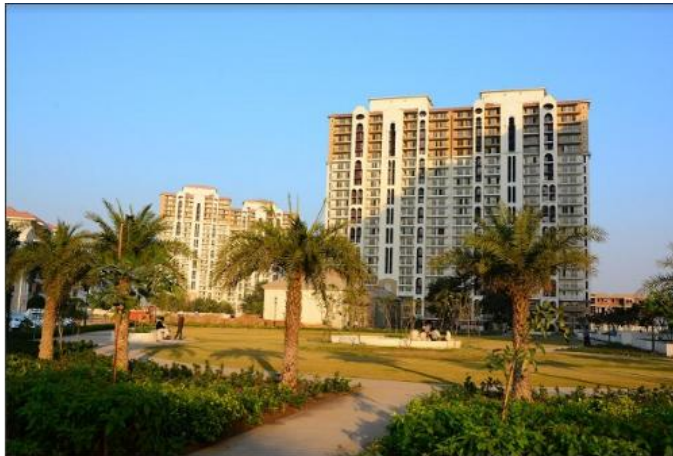
DLF Gardencity, New Gurugram

Fuelled by affordable property, good connectivity, and an upsurge in the development of infrastructure, New Gurugram has emerged as a vibrant residential and commercial hub in the NCR. The new sectors of Gurugram are fast developing in terms of connectivity as well as social infrastructure. With prominent education institutions like BML Munjal University, Amity University, GD Goenka College, DPG Institute of technology and Management, and the recent opening of New Gurugram University and AIIMS, the position of New Gurugram amongst the educational hubs of NCR has gone to a whole new level.