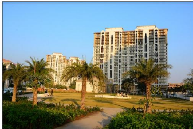
DLF Gardencity, New Gurugram

Fuelled by affordable property, good connectivity, and an upsurge in the development of infrastructure, New Gurugram has emerged as a vibrant residential and commercial hub in the NCR. The new sectors of Gurugram are fast developing in terms of connectivity as well as social infrastructure. With prominent education institutions like BML Munjal University, Amity University, GD Goenka College, DPG Institute of technology and Management, and the recent opening of New Gurugram University and AIIMS, the position of New Gurugram amongst the educational hubs of NCR has gone to a whole new level.