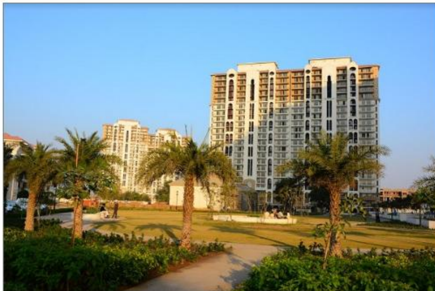
DLF Gardencity, New Gurugram

Fuelled by affordable property, good connectivity, and an upsurge in the development of infrastructure, New Gurugram has emerged as a vibrant residential and commercial hub in the NCR. The new sectors of Gurugram are fast developing in terms of connectivity as well as social infrastructure. With prominent education institutions like BML Munjal University, Amity University, GD Goenka College, DPG Institute of technology and Management, and the recent opening of New Gurugram University and AIIMS, the position of New Gurugram amongst the educational hubs of NCR has gone to a whole new level.