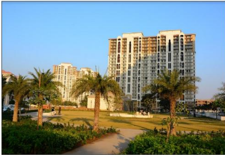
DLF Gardencity, New Gurugram

Fuelled by affordable property, good connectivity, and an upsurge in the development of infrastructure, New Gurugram has emerged as a vibrant residential and commercial hub in the NCR. The new sectors of Gurugram are fast developing in terms of connectivity as well as social infrastructure. With prominent education institutions like BML Munjal University, Amity University, GD Goenka College, DPG Institute of technology and Management, and the recent opening of New Gurugram University and AllMS, the position of New Gurugram amongst the educational hubs of NCR has gone to a whole new level.