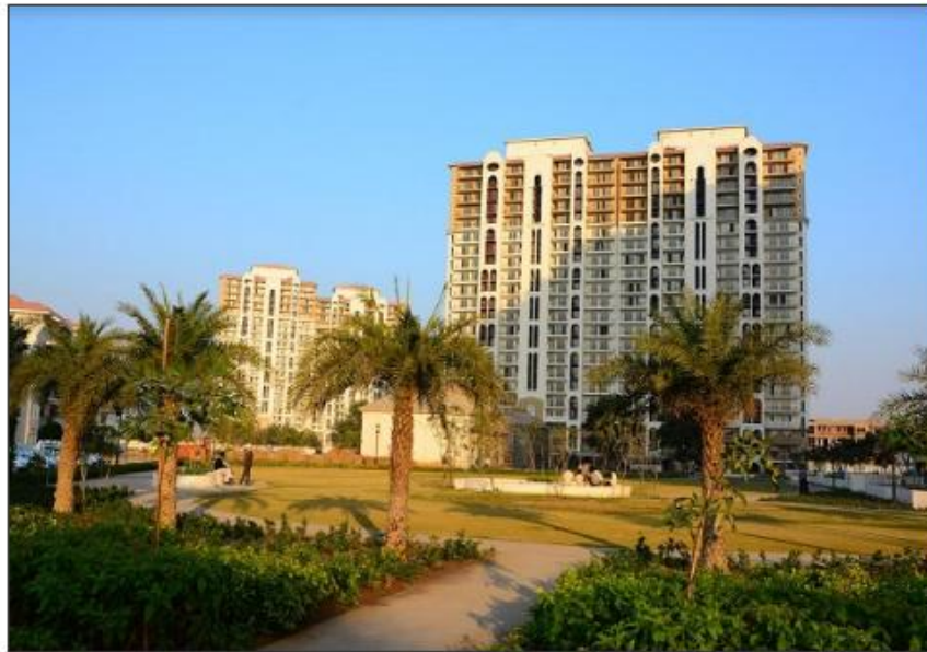
DLF Gardencity, New Gurugram

Fuelled by affordable property, good connectivity, and an upsurge in the development of infrastructure, New Gurugram has emerged as a vibrant residential and commercial hub in the NCR. The new sectors of Gurugram are fast developing in terms of connectivity as well as social infrastructure. With prominent education institutions like BML Munjal University, Amity University, GD Goenka College, DPG Institute of technology and Management, and the recent opening of New Gurugram University and AIIMS, the position of New Gurugram amongst the educational hubs of NCR has gone to a whole new level.