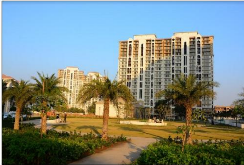
DLF Gardencity, New Gurugram

Fuelled by affordable property, good connectivity, and an upsurge in the development of infrastructure, New Gurugram has emerged as a vibrant residential and commercial hub in the NCR. The new sectors of Gurugram are fast developing in terms of connectivity as well as social infrastructure. With prominent education institutions like BML Munjal University, Amity University, GD Goenka College, DPG Institute of technology and Management, and the recent opening of New Gurugram University and AIIMS, the position of New Gurugram amongst the educational hubs of NCR has gone to a whole new level.