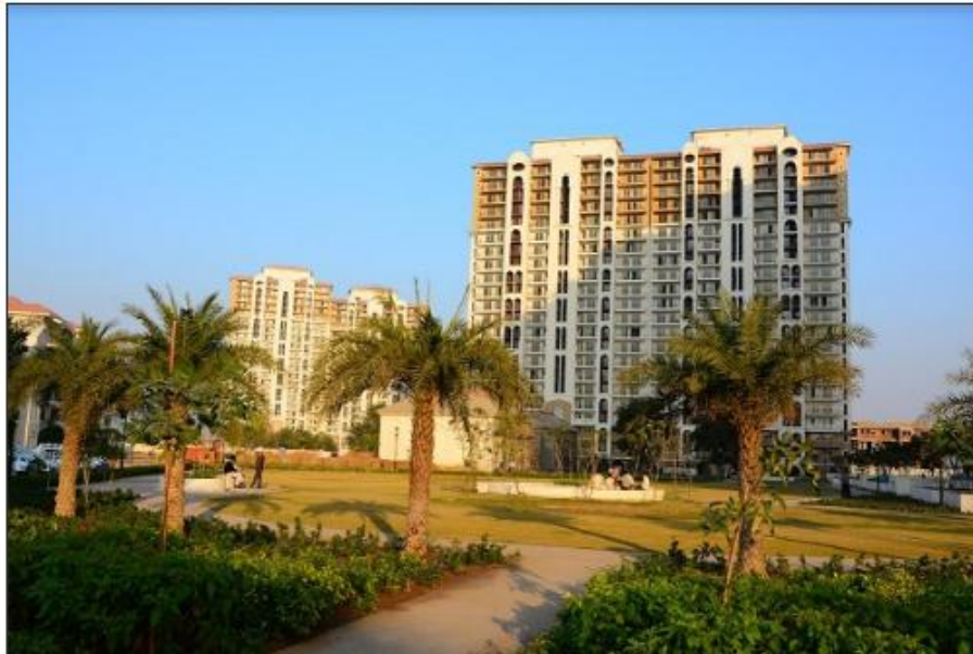
DLF Gardencity, New Gurugram

Fuelled by affordable property, good connectivity, and an upsurge in the development of infrastructure, New Gurugram has emerged as a vibrant residential and commercial hub in the NCR. The new sectors of Gurugram are fast developing in terms of connectivity as well as social infrastructure. With prominent education institutions like BML Munjal University, Amity University, GD Goenka College, DPG Institute of technology and Management, and the recent opening of New Gurugram University and AIIMS, the position of New Gurugram amongst the educational hubs of NCR has gone to a whole new level.