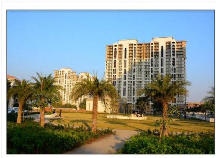
DLF Gardencity, New Gurugram

Fuelled by affordable property, good connectivity, and an upsurge in the development of infrastructure, New Gurugram has emerged as a vibrant residential and commercial hub in the NCR. The new sectors of Gurugram are fast developing in terms of connectivity as well as social infrastructure. With prominent education institutions like BML Munjal University, Amity University, GD Goenka College, DPG Institute of technology and Management, and the recent opening of New Gurugram University and AIIMS, the position of New Gurugram amongst the educational hubs of NCR has gone to a whole new level.