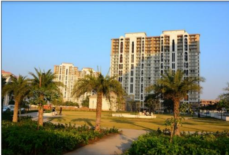
DLF Gardencity, New Gurugram

Fuelled by affordable property, good connectivity, and an upsurge in the development of infrastructure, New Gurugram has emerged as a vibrant residential and commercial hub in the NCR. The new sectors of Gurugram are fast developing in terms of connectivity as well as social infrastructure. With prominent education institutions like BML Munjal University, Amity University, GD Goenka College, DPG Institute of technology and Management, and the recent opening of New Gurugram University and AIIMS, the position of New Gurugram amongst the educational hubs of NCR has gone to a whole new level.