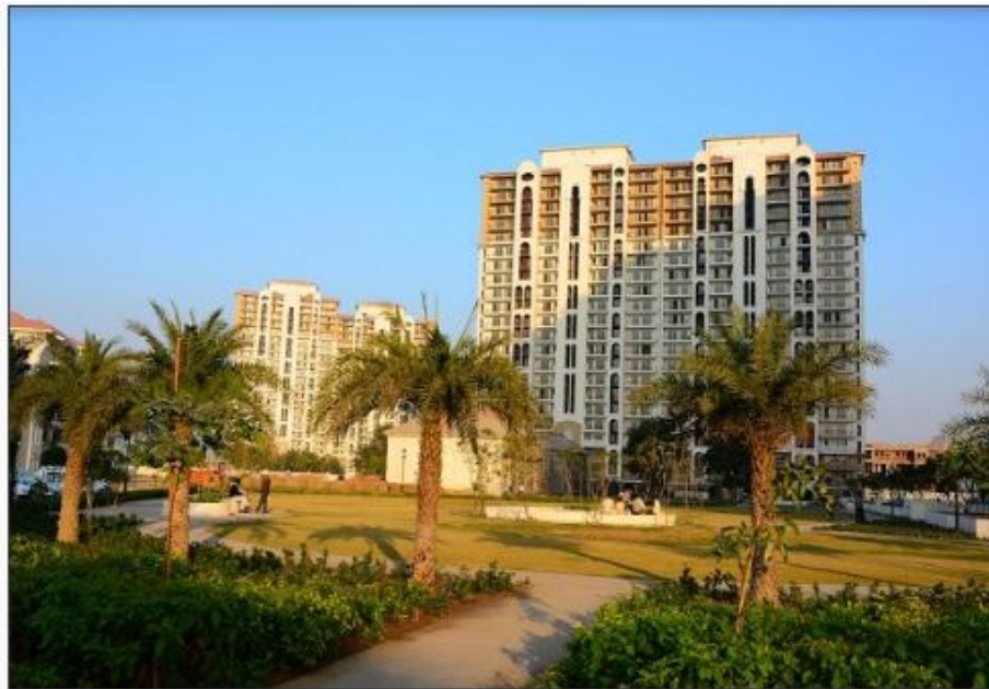
DLF Gardencity, New Gurugram

Fuelled by affordable property, good connectivity, and an upsurge in the development of infrastructure, New Gurugram has emerged as a vibrant residential and commercial hub in the NCR. The new sectors of Gurugram are fast developing in terms of connectivity as well as social infrastructure. With prominent education institutions like BML Munjal University, Amity University, GD Goenka College, DPG Institute of technology and Management, and the recent opening of New Gurugram University and AIIMS, the position of New Gurugram amongst the educational hubs of NCR has gone to a whole new level.