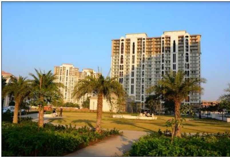
DLF Gardencity, New Gurugram

Fuelled by affordable property, good connectivity, and an upsurge in the development of infrastructure, New Gurugram has emerged as a vibrant residential and commercial hub in the NCR. The new sectors of Gurugram are fast developing in terms of connectivity as well as social infrastructure. With prominent education institutions like BML Munjal University, Amity University, GD Goenka College, DPG Institute of technology and Management, and the recent opening of New Gurugram University and AIIMS, the position of New Gurugram amongst the educational hubs of NCR has gone to a whole new level.