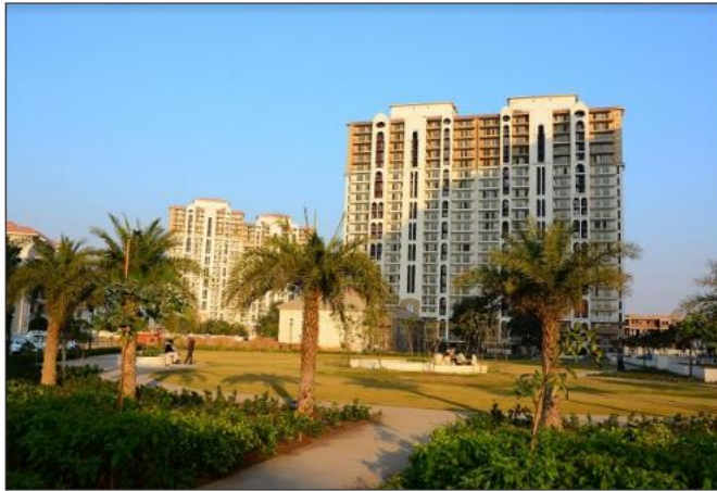
DLF Gardencity, New Gurugram

Fuelled by affordable property, good connectivity, and an upsurge in the development of infrastructure, New Gurugram has emerged as a vibrant residential and commercial hub in the NCR. The new sectors of Gurugram are fast developing in terms of connectivity as well as social infrastructure. With prominent education institutions like BML Munjal University, Amity University, GD Goenka College, DPG Institute of technology and Management, and the recent opening of New Gurugram University and AIIMS, the position of New Gurugram amongst the educational hubs of NCR has gone to a whole new level.