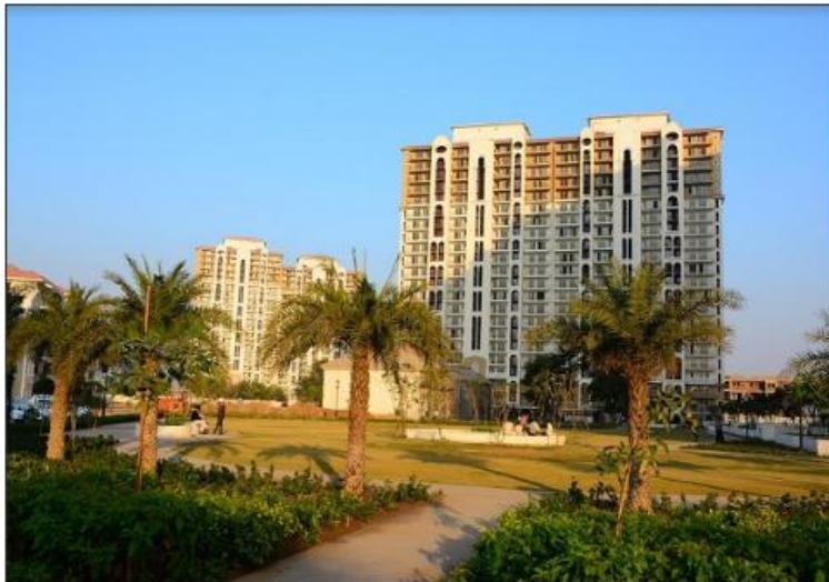
DLF Gardencity, New Gurugram

Fuelled by affordable property, good connectivity, and an upsurge in the development of infrastructure, New Gurugram has emerged as a vibrant residential and commercial hub in the NCR. The new sectors of Gurugram are fast developing in terms of connectivity as well as social infrastructure. With prominent education institutions like BML Munjal University, Amity University, GD Goenka College, DPG Institute of technology and Management, and the recent opening of New Gurugram University and AIIMS, the position of New Gurugram amongst the educational hubs of NCR has gone to a whole new level.