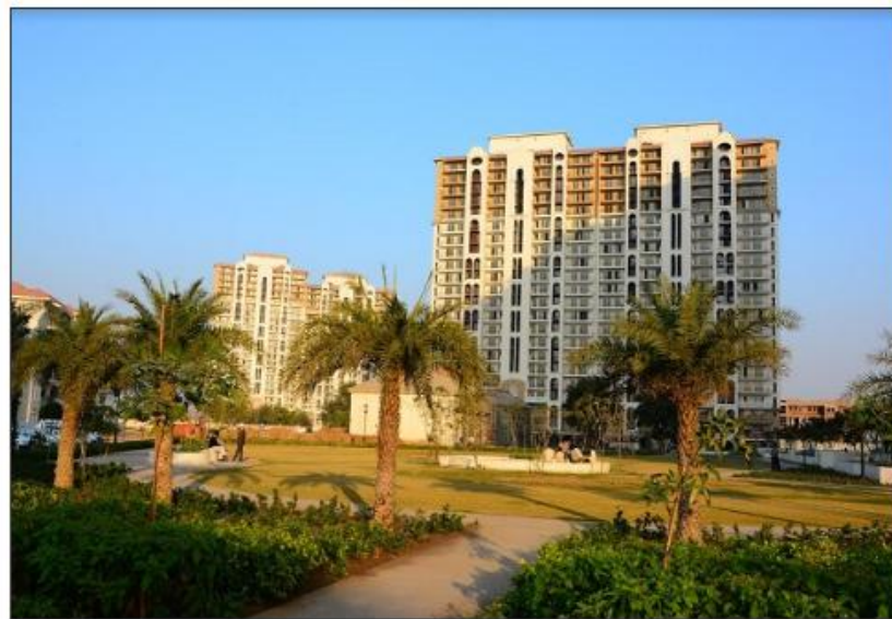
DLF Gardencity, New Gurugram

Fuelled by affordable property, good connectivity, and an upsurge in the development of infrastructure, New Gurugram has emerged as a vibrant residential and commercial hub in the NCR. The new sectors of Gurugram are fast developing in terms of connectivity as well as social infrastructure. With prominent education institutions like BML Munjal University, Amity University, GD Goenka College, DPG Institute of technology and Management, and the recent opening of New Gurugram University and AIIMS, the position of New Gurugram amongst the educational hubs of NCR has gone to a whole new level.