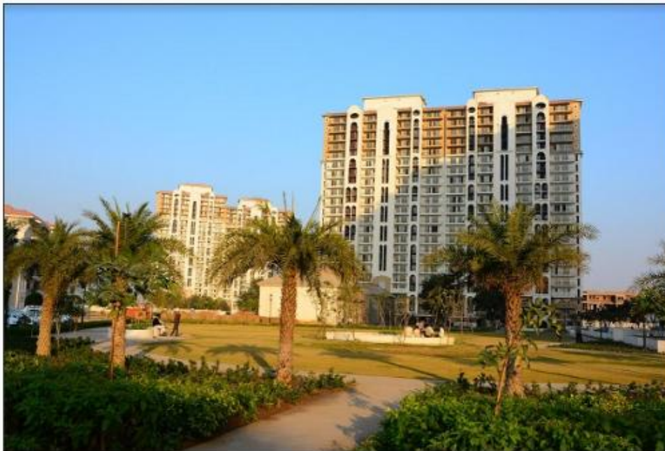
DLF Gardencity, New Gurugram

Fuelled by affordable property, good connectivity, and an upsurge in the development of infrastructure, New Gurugram has emerged as a vibrant residential and commercial hub in the NCR. The new sectors of Gurugram are fast developing in terms of connectivity as well as social infrastructure. With prominent education institutions like BML Munjal University, Amity University, GD Goenka College, DPG Institute of technology and Management, and the recent opening of New Gurugram University and AIIMS, the position of New Gurugram amongst the educational hubs of NCR has gone to a whole new level.