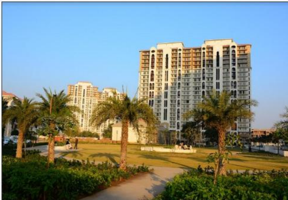
DLF Gardencity, New Gurugram

Fuelled by affordable property, good connectivity, and an upsurge in the development of infrastructure, New Gurugram has emerged as a vibrant residential and commercial hub in the NCR. The new sectors of Gurugram are fast developing in terms of connectivity as well as social infrastructure. With prominent education institutions like BML Munjal University, Amity University, GD Goenka College, DPG Institute of technology and Management, and the recent opening of New Gurugram University and AIIMS, the position of New Gurugram amongst the educational hubs of NCR has gone to a whole new level.