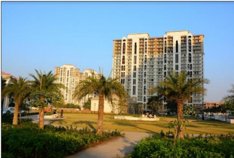
DLF Gardencity, New Gurugram

Fuelled by affordable property, good connectivity, and an upsurge in the development of infrastructure, New Gurugram has emerged as a vibrant residential and commercial hub in the NCR. The new sectors of Gurugram are fast developing in terms of connectivity as well as social infrastructure. With prominent education institutions like BML Munjal University, Amity University, GD Goenka College, DPG Institute of technology and Management, and the recent opening of New Gurugram University and AIIMS, the position of New Gurugram amongst the educational hubs of NCR has gone to a whole new level.