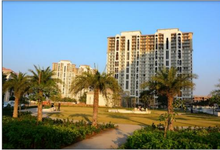
DLF Gardency, New Gurugram

The area enjoys strategic location between Delhi and Manesar with direct connectivity to NH-8. Furthermore, a slew of infrastructure developments in the region like the already completed Southern Peripheral Road (SPR), the soon to be completed Northern Periphery Road (NPR) & Central Periphery Road (CPR) and newly operational Kundli-Manesar-Palwal (KMP) Expressway and the alternate bypass road to Manesar will provide a fillip to connectivity.