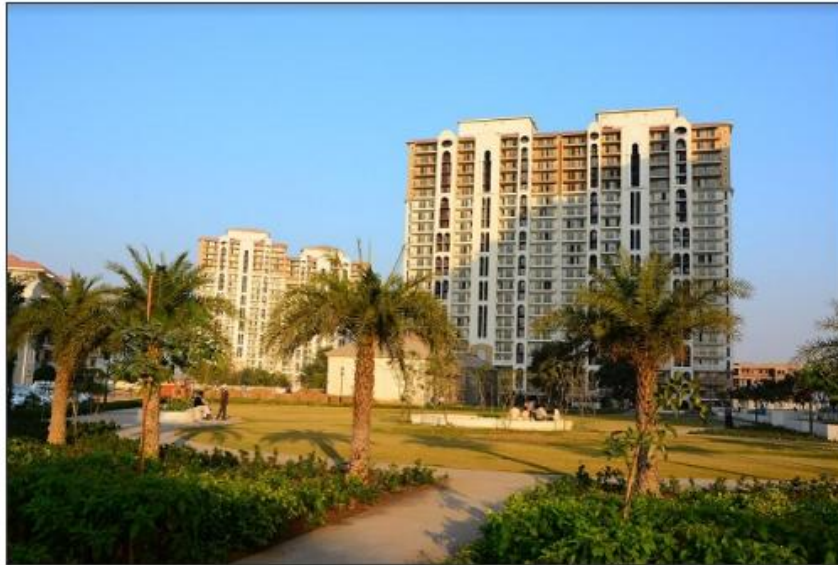
DLF Gardencity, New Gurugram

Fuelled by affordable property, good connectivity, and an upsurge in the development of infrastructure, New Gurugram has emerged as a vibrant residential and commercial hub in the NCR. The new sectors of Gurugram are fast developing in terms of connectivity as well as social infrastructure. With prominent education institutions like BML Munjal University, Amity University, GD Goenka College, DPG Institute of technology and Management, and the recent opening of New Gurugram University and AIIMS, the position of New Gurugram amongst the educational hubs of NCR has gone to a whole new level.