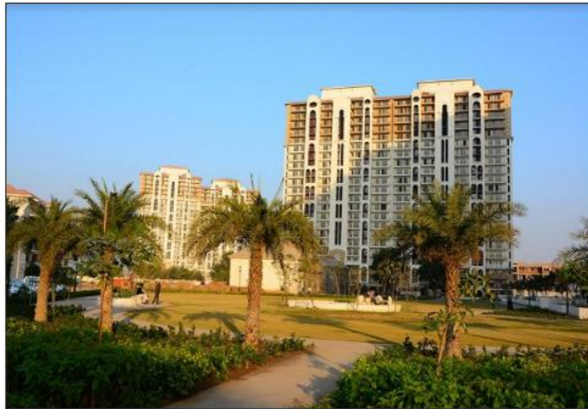
DLF Gardencity, New Gurugram

Fuelled by affordable property, good connectivity, and an upsurge in the development of infrastructure, New Gurugram has emerged as a vibrant residential and commercial hub in the NCR. The new sectors of Gurugram are fast developing in terms of connectivity as well as social infrastructure. With prominent education institutions like BML Munjal University, Amity University, GD Goenka College, DPG Institute of technology and Management, and the recent opening of New Gurugram University and AIIMS, the position of New Gurugram amongst the educational hubs of NCR has gone to a whole new level.