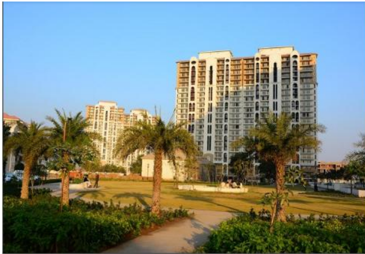
DLF Gardencity, New Gurugram

Fuelled by affordable property, good connectivity, and an upsurge in the development of infrastructure, New Gurugram has emerged as a vibrant residential and commercial hub in the NCR. The new sectors of Gurugram are fast developing in terms of connectivity as well as social infrastructure. With prominent education institutions like BML Munjal University, Amity University, GD Goenka College, DPG Institute of technology and Management, and the recent opening of New Gurugram University and AIIMS, the position of New Gurugram amongst the educational hubs of NCR has gone to a whole new level.