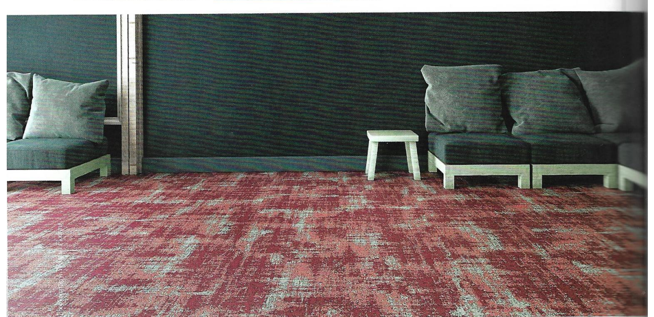
To develop products that suit both the Indian consumer and geographic conditions, the role of R&D becomes the most important.

300 DPI resolution, resulting in finer and natural textual patterns." Besides, the company has recently launched MarbleX, Eco Blanco and TAC Tiles. MarbleX is an ideal wall and floor solution and an ideal choice for facades. While Eco Blanco has a good SRI, making it an optimal flooring solution for roofs, TAC Tile is a range of floor tiles to assist the visually impaired.