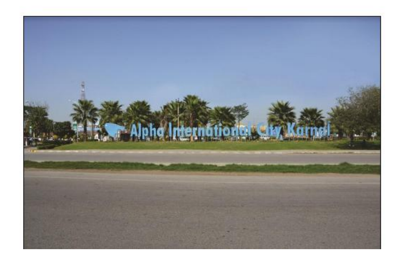
NH 1 Entrance Signage 1 Alpha International City - Karnal

Karnal is considered to be one of the most ideal destinations for real estate investment in NCR. The city has everything to attract the ultimate end user towards it. Located on six lane Chandigarh expressway right in-between the Delhi-Chandigarh route is one of the most desired residential hubs in NCR as it has easy transportation to many cross country locations, advanced security measures like CCTV cameras and the most important pollution free and green locality.