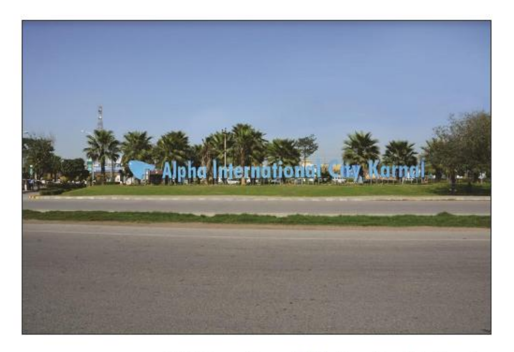
NH 1 Entrance Signage 1 Alpha International City - Karnal

Karnal is considered to be one of the most ideal destinations for real estate investment in NCR. The city has everything to attract the ultimate end user towards it. Located on six lane Chandigarh expressway right in-between the Delhi-Chandigarh route is one of the most desired residential hubs in NCR as it has easy transportation to many cross country locations, advanced security measures like CCTV cameras and the most important pollution free and green locality.