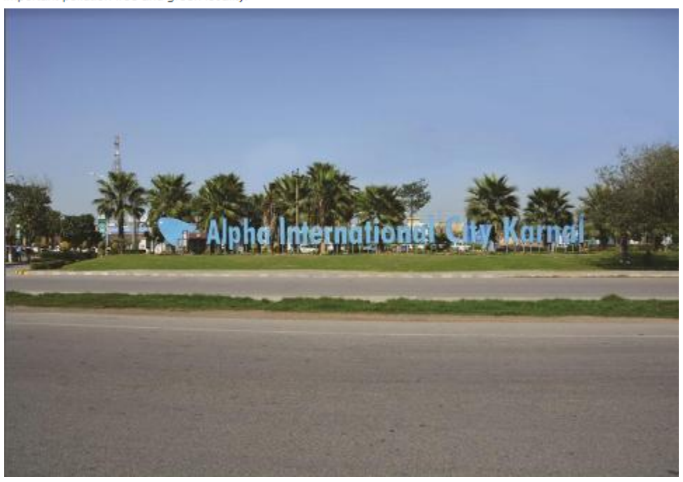
NH 1 Entrance Signage 1 Alpha International City - Karnal

Karnal is considered to be one of the most ideal destinations for real estate investment in NCR. The city has everything to attract the ultimate end user towards it. Located on six lane Chandigarh expressway right in-between the Delhi-Chandigarh route is one of the most desired residential hubs in NCR as it has easy transportation to many cross country locations, advanced security measures like CCTV cameras and the most important pollution free and green locality.