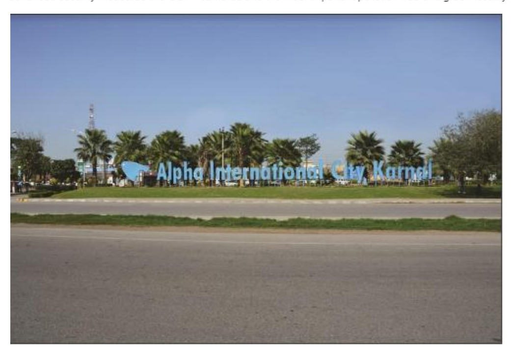
NH 1 Entrance Signage 1 Alpha International City - Karnal

Karnal is considered to be one of the most ideal destinations for real estate investment in NCR. The city has everything to attract the ultimate end user towards it. Located on six lane Chandigarh expressway right in-between the Delhi-Chandigarh route is one of the most desired residential hubs in NCR as it has easy transportation to many cross country locations, advanced security measures like CCTV cameras and the most important pollution free and green locality.