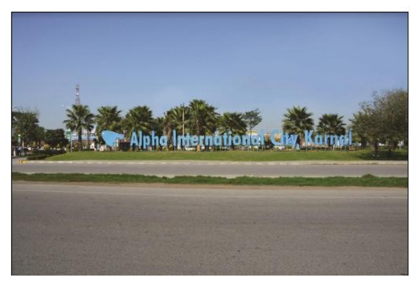
NH 1 Entrance Signage 1 Alpha International City - Karnal

Karnal is considered to be one of the most ideal destinations for real estate investment in NCR. The city has everything to attract the ultimate end user towards it. Located on six lane Chandigarh expressway right in-between the Delhi-Chandigarh route is one of the most desired residential hubs in NCR as it has easy transportation to many cross country locations, advanced security measures like CCTV cameras and the most important pollution free and green locality.