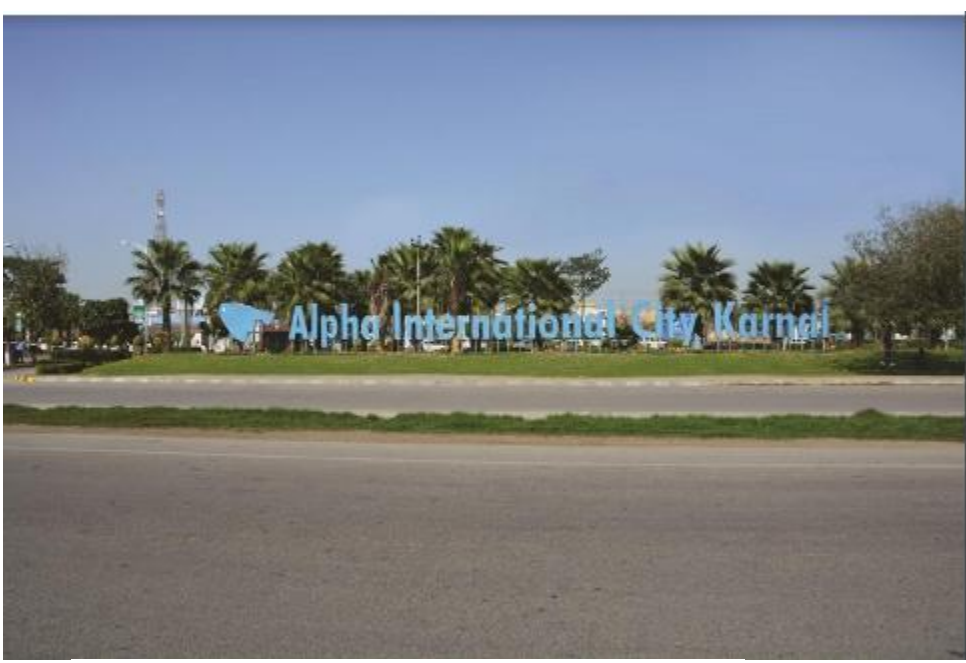
NH 1 Entrance Signage 1 Alpha International City - Karnal

Kamal is considered to be one of the most ideal destinations for real estate investment in NCR. The city has everything to attract the ultimate end user towards it. Located on six lane Chandigarh expressway right in-between the Delhi-Chandigarh route is one of the most desired residential hubs in NCR as it has easy transportation to many cross country locations, advanced security measures like CCTV cameras and the most important pollution free and oreen locality.