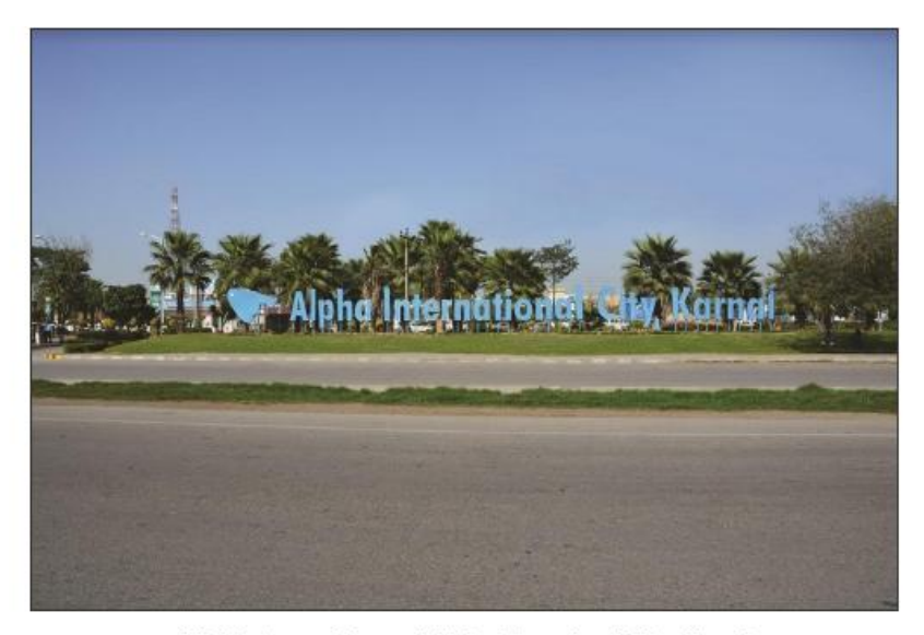
NH 1 Entrance Signage 1 Alpha International City - Karnal

Karnal is considered to be one of the most ideal destinations for real estate investment in NCR. The city has everything to attract the ultimate end user towards it. Located on six lane Chandigarh expressway right in-between the Delhi-Chandigarh route is one of the most desired residential hubs in NCR as it has easy transportation to many cross country locations, advanced security measures like CCTV cameras and the most important pollution free and green locality.