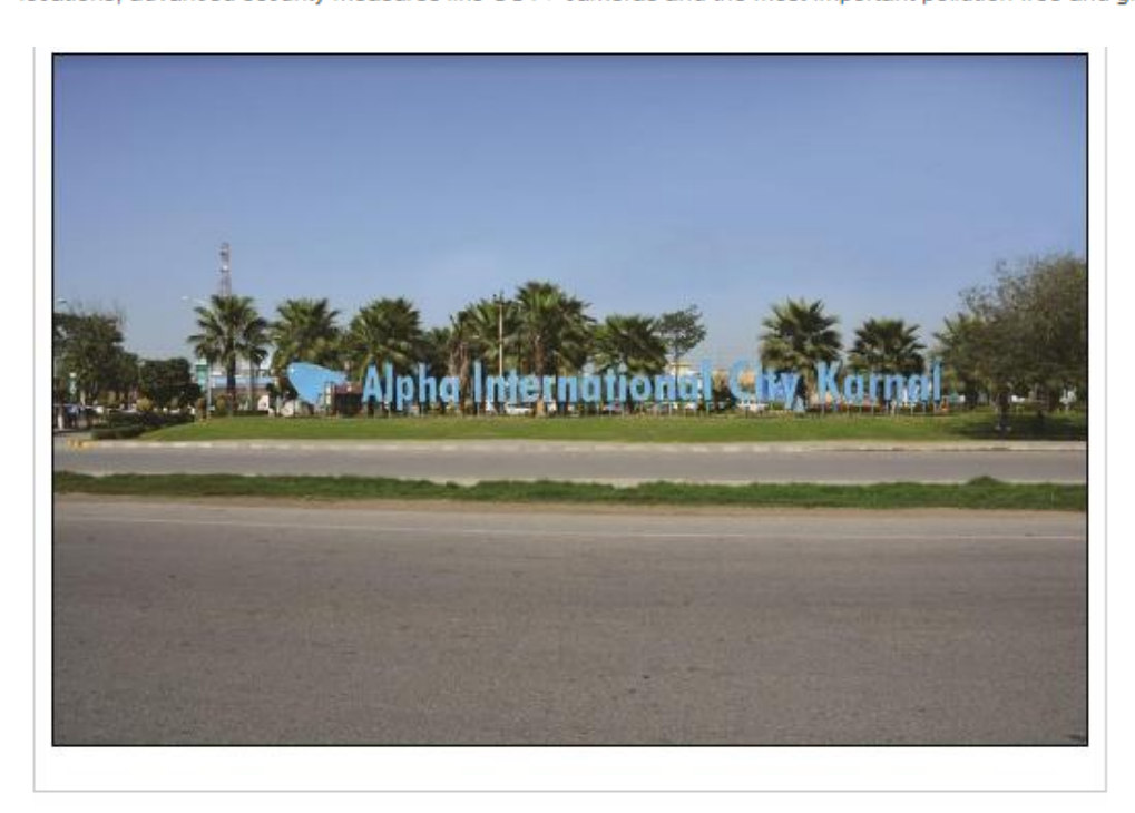
NH 1 Entrance Signage 1 Alpha International City - Karnal

Karnal is considered to be one of the most ideal destinations for real estate investment in NCR. The city has everything to attract the ultimate end user towards it. Located on six lane Chandigarh expressway right in-between the Delhi-Chandigarh route is one of the most desired residential hubs in NCR as it has easy transportation to many cross country locations, advanced security measures like CCTV cameras and the most important pollution free and green locality.