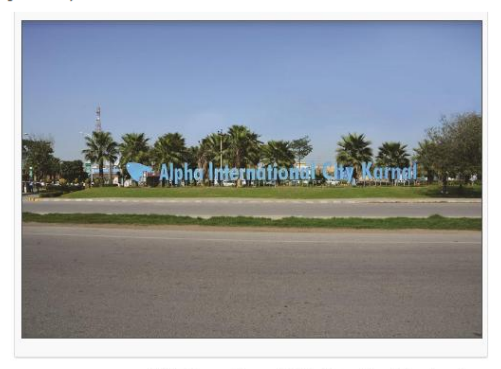
NH 1 Entrance Signage 1 Alpha International City - Karnal

Karnal is considered to be one of the most ideal destinations for real estate investment in NCR. The city has everything to attract the ultimate end user towards it. Located on six lane Chandigarh expressway right in-between the Delhi-Chandigarh route is one of the most desired residential hubs in NCR as it has easy transportation to many cross country locations, advanced security measures like CCTV cameras and the most important pollution free and green locality.