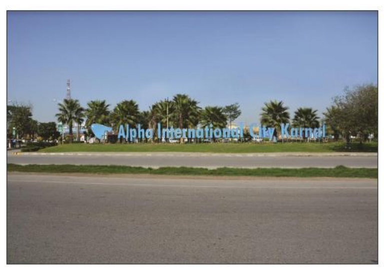
NH 1 Entrance Signage 1 Alpha International City - Karnal

Karnal is considered to be one of the most ideal destinations for real estate investment in NCR. The city has everything to attract the ultimate end user towards it. Located on six lane Chandigarh expressway right in-between the Delhi-Chandigarh route is one of the most desired residential hubs in NCR as it has easy transportation to many cross country locations, advanced security measures like CCTV cameras and the most important pollution free and green locality.