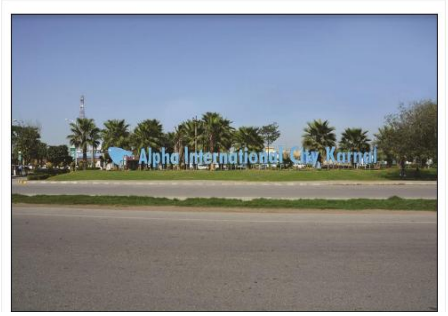
NH 1 Entrance Signage 1 Alpha International City - Karnal

Karnal is considered to be one of the most ideal destinations for real estate investment in NCR. The city has everything to attract the ultimate end user towards it. Located on six lane Chandigarh expressway right in-between the Delhi-Chandigarh route is one of the most desired residential hubs in NCR as it has easy transportation to many cross country locations, advanced security measures like CCTV cameras and the most important pollution free and green locality.