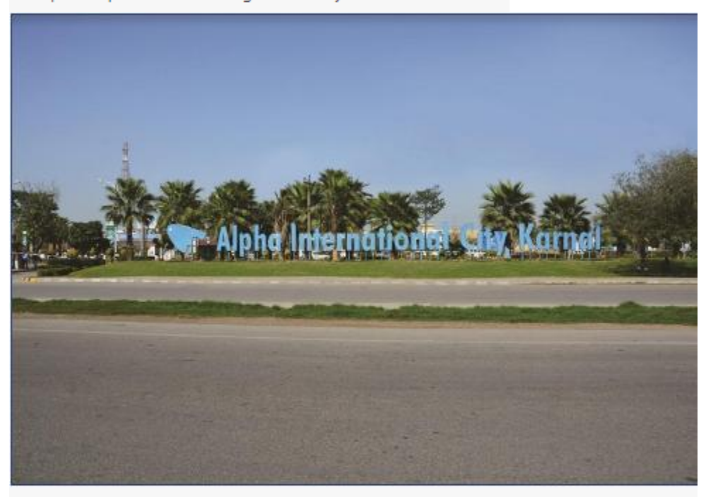
NH 1 Entrance Signage 1 Alpha International City -Karnal

Karnal is considered to be one of the most ideal destinations for real estate investment in NCR. The city has everything to attract the ultimate end user towards it. Located on six lane Chandigarh expressway right inbetween the Delhi-Chandigarh route is one of the most desired residential hubs in NCR as it has easy transportation to many cross country locations, advanced security measures like CCTV cameras and the most important pollution free and green locality.