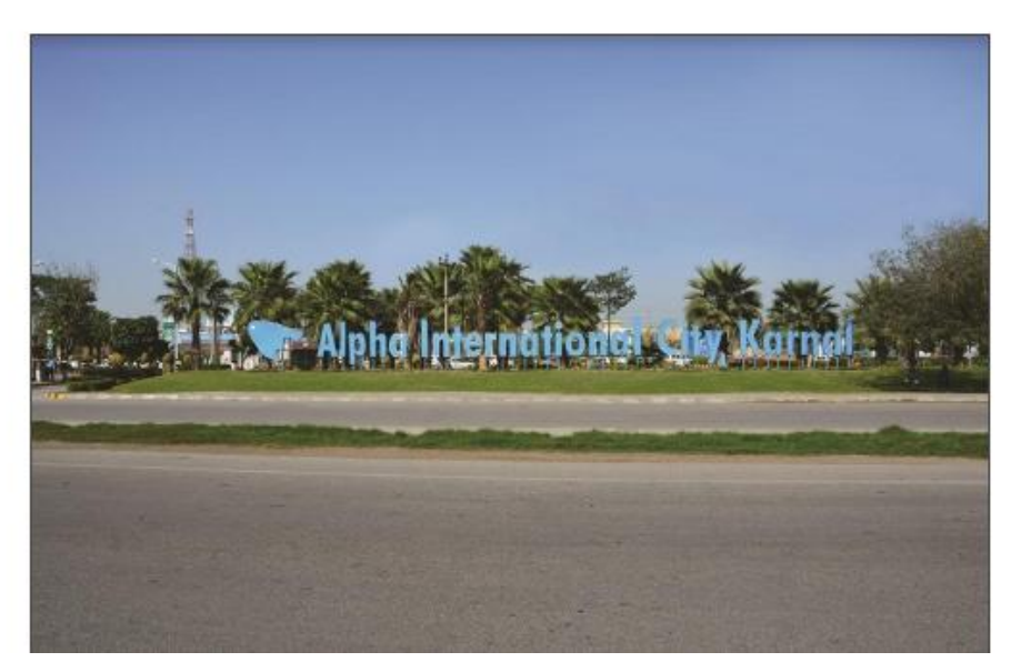
NH 1 Entrance Signage 1 Alpha International City - Karnal

Karnal is considered to be one of the most ideal destinations for real estate investment in NCR. The city has everything to attract the ultimate end user towards it. Located on six lane Chandigarh expressway right in-between the Delhi-Chandigarh route is one of the most desired residential hubs in NCR as it has easy transportation to many cross country locations, advanced security measures like CCTV cameras and the most important pollution free and green locality.