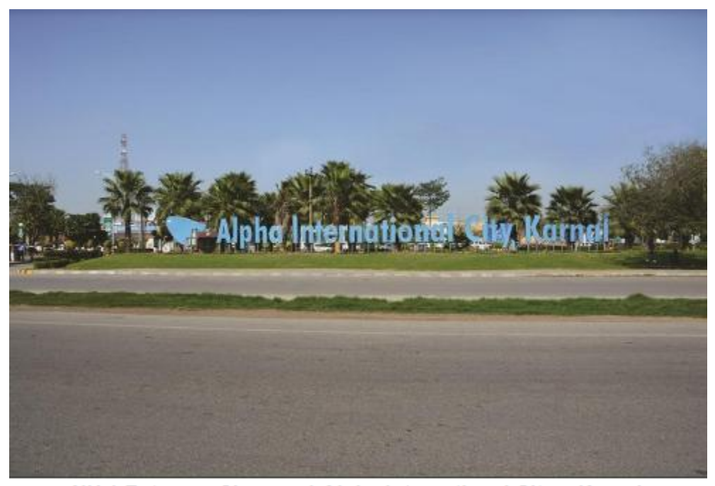
NH 1 Entrance Signage 1 Alpha International City - Karnal

Karnal is considered to be one of the most ideal destinations for real estate investment in NCR. The city has everything to attract the ultimate end user towards it. Located on six lane Chandigarh expressway right in-between the Delhi-Chandigarh route is one of the most desired residential hubs in NCR as it has easy transportation to many cross country locations, advanced security measures like CCTV cameras and the most important pollution free and green locality.