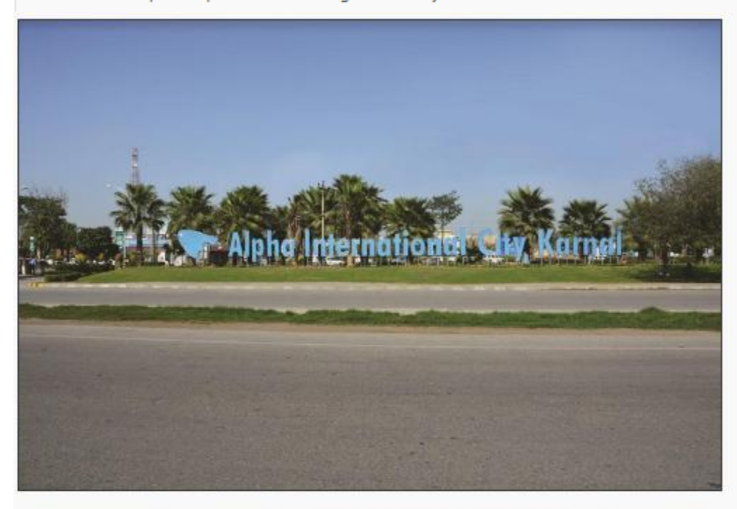
NH 1 Entrance Signage 1 Alpha International City - Karnal

Karnal is considered to be one of the most ideal destinations for real estate investment in NCR. The city has everything to attract the ultimate end user towards it. Located on six lane Chandigarh expressway right in-between the Delhi-Chandigarh route is one of the most desired residential hubs in NCR as it has easy transportation to many cross country locations, advanced security measures like CCTV cameras and the most important pollution free and green locality.