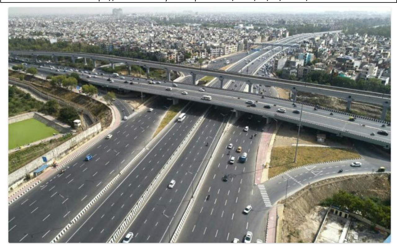
KMP Expressway beats the clock will impact the real estate market of NCR

Prime Minister Narendra Modi on Monday inaugurated Kundli Manesar Palwal (KMP) Expressway at Gurugram. Also known as the Western Peripheral Expressway, this 135 km-long Expressway originates from Kundli (near Sonipat) and connects Palwal (near Faridabad) through Manesar (near Gurugram). It connects 4 highways — NH-1, NH-2, NH-8, and NH-10 in Haryana. The ambitious project will have a huge impact on the real estate market of NCR.