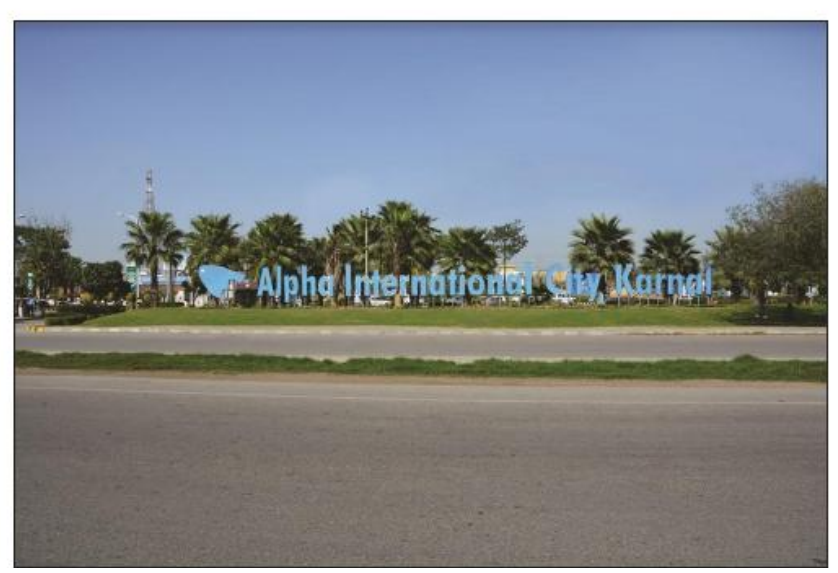
NH 1 Entrance Signage 1 Alpha International City - Karnal

Karnal is considered to be one of the most ideal destinations for real estate investment in NCR. The city has everything to attract the ultimate end user towards it. Located on six lane Chandigarh expressway right in-between the Delhi-Chandigarh route is one of the most desired residential hubs in NCR as it has easy transportation to many cross country locations, advanced security measures like CCTV cameras and the most important pollution free and green locality.