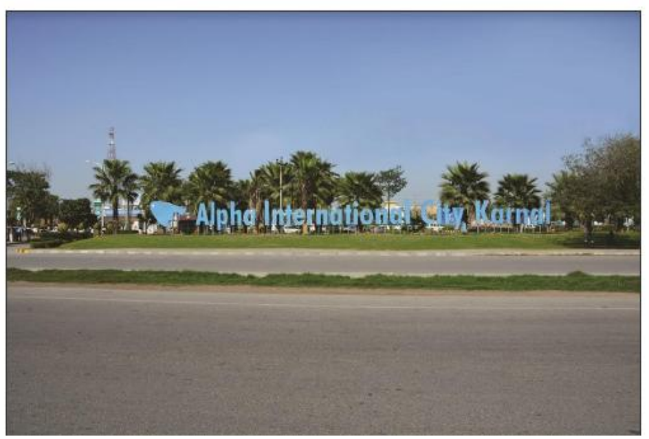
NH 1 Entrance Signage 1 Alpha International City - Karnal

Karnal is considered to be one of the most ideal destinations for real estate investment in NCR. The city has everything to attract the ultimate end user towards it. Located on six lane Chandigarh expressway right in-between the Delhi-Chandigarh route is one of the most desired residential hubs in NCR as it has easy transportation to many cross country locations, advanced security measures like CCTV cameras and the most important pollution free and green locality.