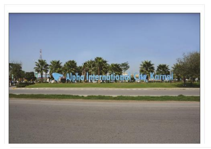
NH 1 Entrance Signage 1 Alpha International City - Karnal

Karnal is considered to be one of the most ideal destinations for real estate investment in NCR. The city has everything to attract the ultimate end user towards it. Located on six lane Chandigarh expressway right in-between the Delhi-Chandigarh route is one of the most desired residential hubs in NCR as it has easy transportation to many cross country locations, advanced security measures like CCTV cameras and the most important pollution free and green locality.