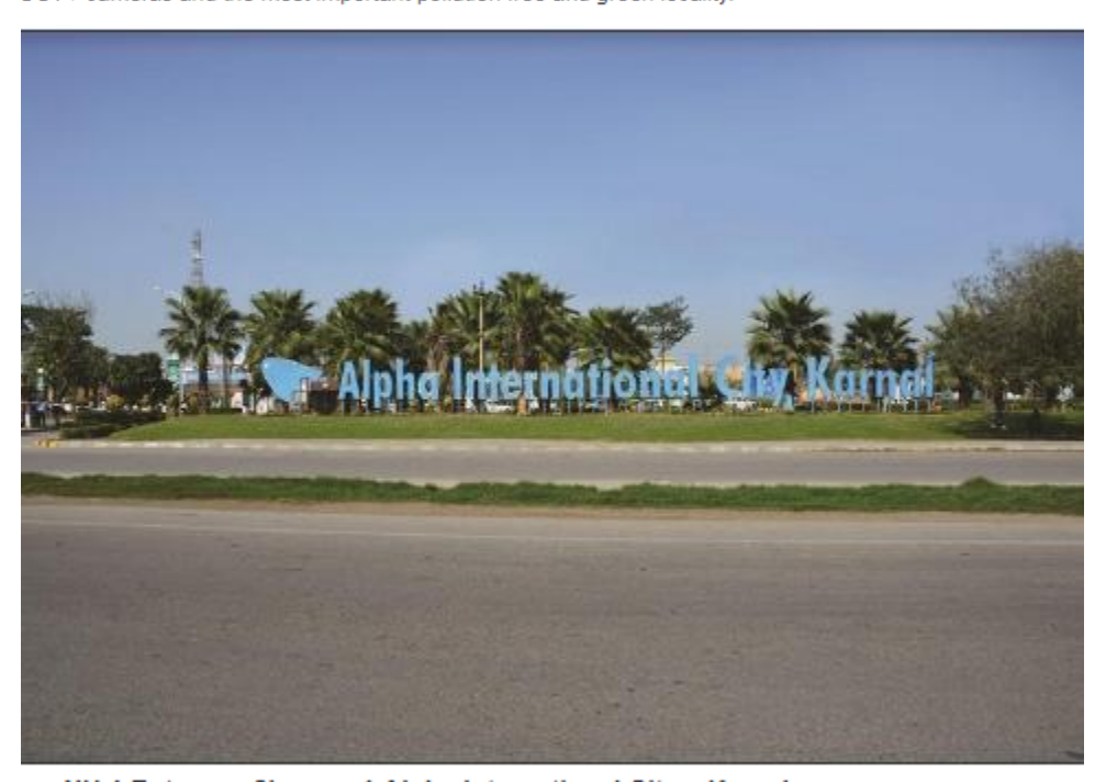
NH 1 Entrance Signage 1 Alpha International City - Karnal

Karnal is considered to be one of the most ideal destinations for real estate investment in NCR. The city has everything to attract the ultimate end user towards it. Located on six lane Chandigarh expressway right in-between the Delhi-Chandigarh route is one of the most desired residential hubs in NCR as it has easy transportation to many cross country locations, advanced security measures like CCTV cameras and the most important pollution free and green locality.