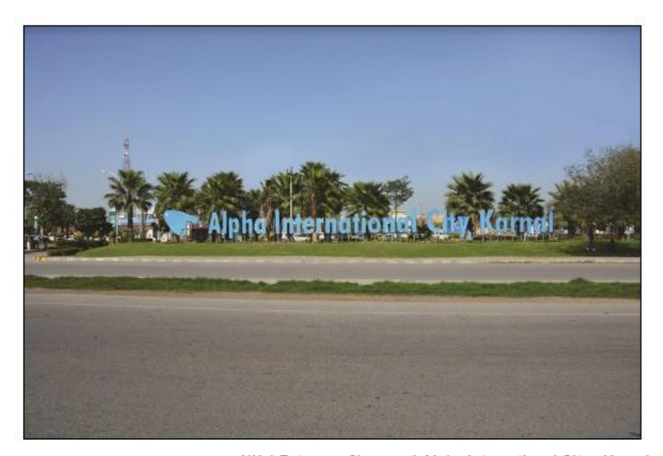
NH 1 Entrance Signage 1 Alpha International City - Karnal

Karnal is considered to be one of the most ideal destinations for real estate investment in NCR. The city has everything to attract the ultimate end user towards it. Located on six lane Chandigarh expressway right in-between the Delhi-Chandigarh route is one of the most desired residential hubs in NCR as it has easy transportation to many cross country locations, advanced security measures like CCTV cameras and the most important pollution free and green locality.