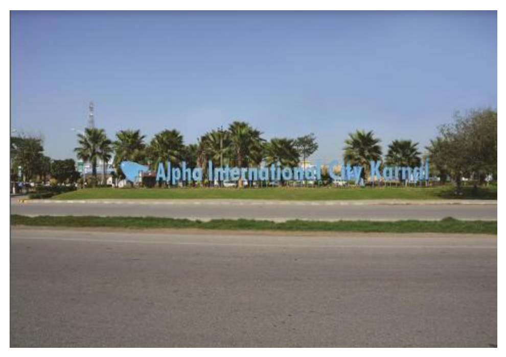
NH 1 Entrance Signage 1 Alpha International City - Karnal

Karnal is considered to be one of the most ideal destinations for real estate investment in NCR. The city has everything to attract the ultimate end user towards it. Located on six lane Chandigarh expressway right in-between the Delhi-Chandigarh route is one of the most desired residential hubs in NCR as it has easy transportation to many cross country locations, advanced security measures like CCTV cameras and the most important pollution free and green locality.